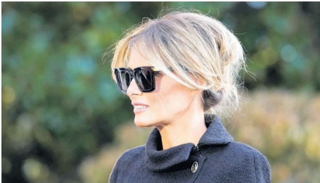
First Lady Melania Trump listens as President Donald Trump speaks with reporters as he walks to board Marine One on the South Lawn of the White House, Wednesday, Jan. 20, 2021, in Washington.